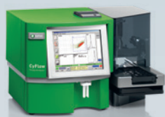
CyFlow® Ploidy Analyser

Precise Cell Counting | Live/Dead Analysis | Cell Cycle Analysis | Cell Size Distribution | Apoptosis